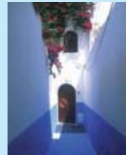
A street in Asilah

concerts. A strategically located port, Asilah has passed through Roman, Spanish and Portuguese hands, and its bastions, towers and defiant walls make for some pleasant walks along a shoreline dotted with restaurants serving excellent cuisine based on fresh local fish.