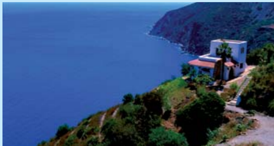
Creeks along the Mediterranean coast