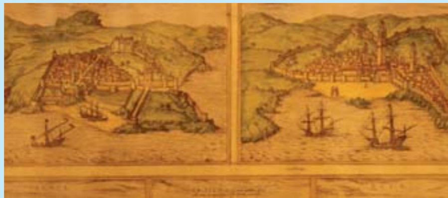
A sketch of Tingi, American Legation Museum

In the centuries that followed, Tangier became a coveted prize in the power struggles between the Idrissids and Umayyads of Spain, and then between the Almoravids, Almohads and Merinids – a prize that Portugal also had its eye on,