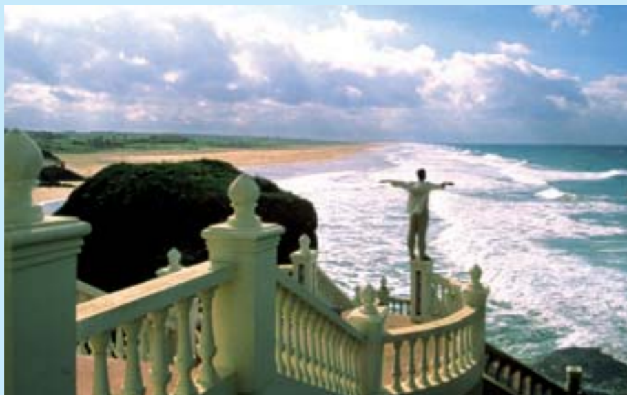
Tangier, city of inspiration

into legend – the El Minzah Hotel, the Continental Hotel, Café de Paris and Café Fuentès, to name but a few! But the city does not simply live on its past. While the ghosts of Eugène Delacroix, Henri Matisse, Oscar Wilde, William Burroughs and Tennessee Williams may still walk its street, it continues to attract and inspire creators from all corners of the world.