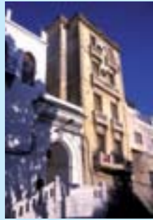
Entrance to the medina

The Grand Socco (Spanish for souk) at the entrance to the medina is undoubtedly the busiest part of the city. Its square is bordered by the former residence of the Mendoub (the Sultan's representative) and its park. The Mendoubia Park is splendidly laid out, dominated by a giant banyan tree, and graced with a multitude of venerable dragon trees.