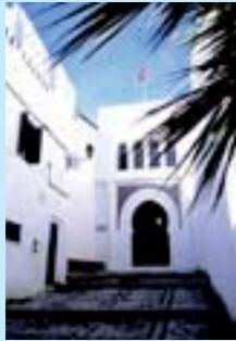
A street in the kasbah

There are signs of an ancient Phoenician settlement in the area – a few scant ruins, including a pair of necropolises, still remain – but the city itself was founded by the Carthaginians in the 4th century BC, as the trading-post of Tingi. In 146 BC, following the fall of Carthage, the town, now known as Tingis, became part of the Kingdom of Mauritania, which was allied to Rome and ruled by Juba II. Under Emperor Claudius, the kingdom became a Roman colony, Tingitan Mauritania, with Tingis as its capital. When the Arabs arrived in 706 AD, the city was taken by their general, Omeyyade Moussa Ibn Noussair, and it was from Tingis that Tarik Ibn Ziad's army set off to conquer Spain in 711.