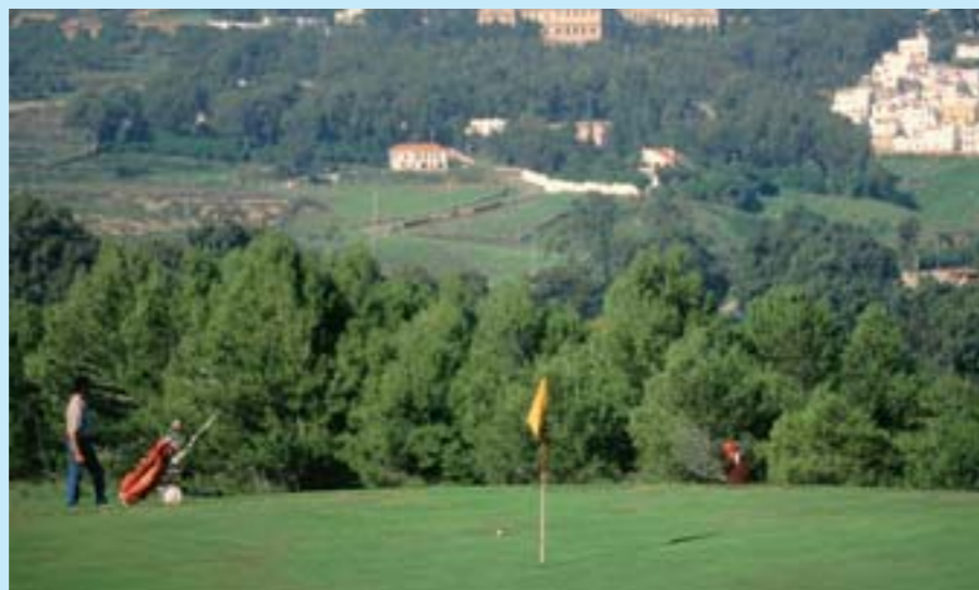
Tangier golf club

Tangier can also take pride in its cricket club, fruit of its bygone English heritage and a venue for matches between international teams.