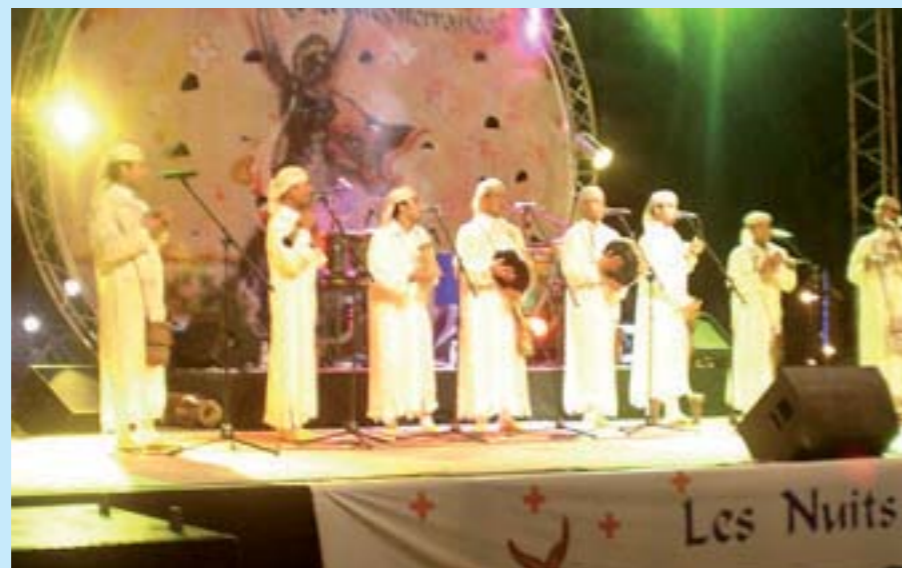
The Mediterranean Nights Festival

The Mediterranean Nights Festival is held in the Mendoubia Park in the heart of the old town and is a week-long celebration of the ancient and modern musical heritages of three continents. It's an ideal opportunity to discover upcoming young artists, and to get to see a variety of great names rarely to be found performing on the World's usual tour