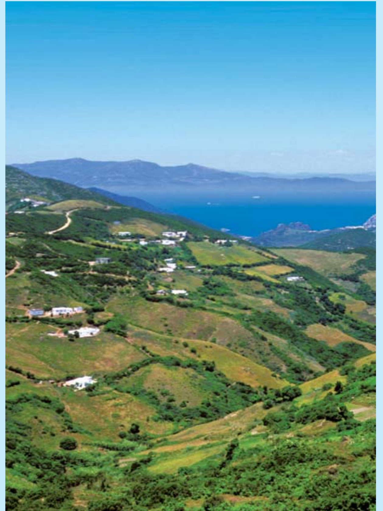
The foothills of the Rif Mountains

Turning inland, we come to the Rif, a young chain of Mountains and ideal ground for trekking and hiking enthusiasts. Talassemrane Park in the Chefchaouen region covers over 60,000 hectares of magnificent mountain massifs and plunging cliffs. The park is home to a wide selection of fauna, including wild boar, foxes, monkeys, Bonelli's eagles, booted eagles, long-legged buzzards, and falcons. Opening on to these rugged and austere mountains, the town of Chefchaouen is a haven of well-being, a remaining fragment of old Andalusia. Its winding streets, medieval houses painted with blue-tinted whitewash and its fine old kasbah make it a favourite destination for artists, and indeed for all those who simply want to sit back and dream the day away.