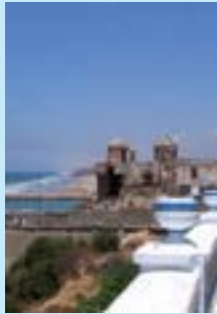
The town of Larache