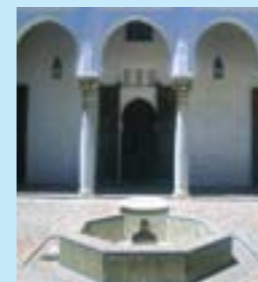
The Kasbah's Museum of Archaeology

It was also in Tangier, in the Mendoubia Park, that King Mohammed V delivered his 1947 speech declaring Moroccan Independence. Tangier was to keep its special status until 1960. Today, the city still has its cosmopolitan side, with a wide variety of outside influences contributing to its cultural diversity and unique personality.