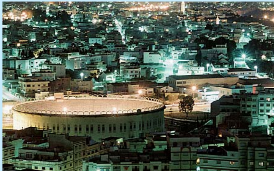
Plaza de Toros

The Kasbah is Tangier's heart and soul, an imposing fortress with walls overlooking the medina and the whole city. You get to it from the Grand Socco via rue d'Italie and uphill along rue de la Kasbah. This is a district of venerable palaces, accommodating some truly superb residences. In Place de la Kasbah, the Sultan's palace, "Dar el Mekhzen", houses a museum of Moroccan arts, while the palace next door, Dar Chorfa, is home to a museum of antiquities and archaeology. Stop for a coffee at the Café du Déroit, which takes its name from the magnificent views of the Straits to be taken from its terrace.