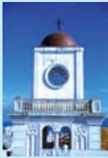
The bell tower of Tangier's church