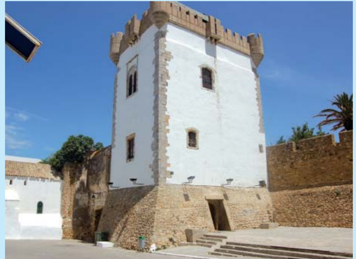
The Portuguese bastion, Asilah

The Azure Lixus resort , currently under construction, is designed as a destination for nature lovers and sailing and water-sports enthusiasts. The resort will include two 18-hole golf courses, a yachting harbour, shops and a forest park., and will also offer a range of activities connected with its hinterland (hunting, horse-riding and excursions). Focusing on "well-being, health and nature", Lixus has selected a magnificent natural setting between the Punta Negra cliff, the Reggada hills, Oued Loukkos, and the Ras Armel forest, a profusion of pine trees, broom trees, dwarf palms and eucalyptus.