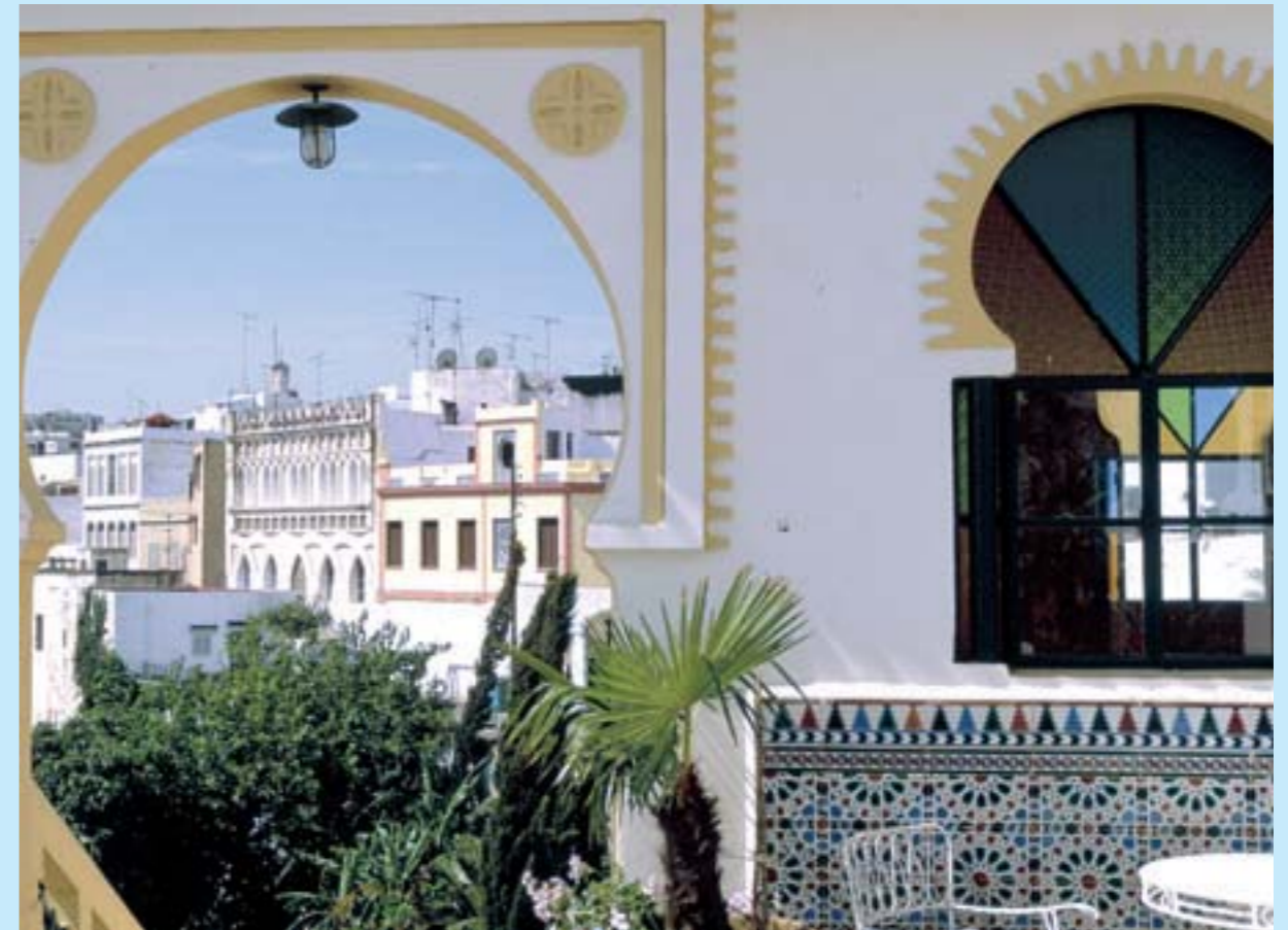
Looking out over Tangier's medina

In the 19th century, European nations began sending increasing numbers of trading and diplomatic missions to Tangier, and in 1906 the Algeceras Conference provided for the city to be accorded special status. In 1925 it became an international zone under the sovereignty of the Sultan of Morocco. The period during which it enjoyed international status was Tangier's golden age – the era of its great cultural and economic influence, and during which it gained the "romantic" reputation exploited by filmmakers and novelists.