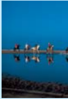
Horse riding along the seashore