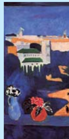
Tangier through Matisse's eyes

The legendary bookshop "Librairie des Colonnes" was where the city's intellectuals – such great literary names as Jean Genet, Paul Bowles, William Burroughs and Tennessee Williams – came to hone their craft. Some never left Tangier. If you're passing through, take a look inside and browse through the works of some of the writers who fell under the city's irresistible spell.