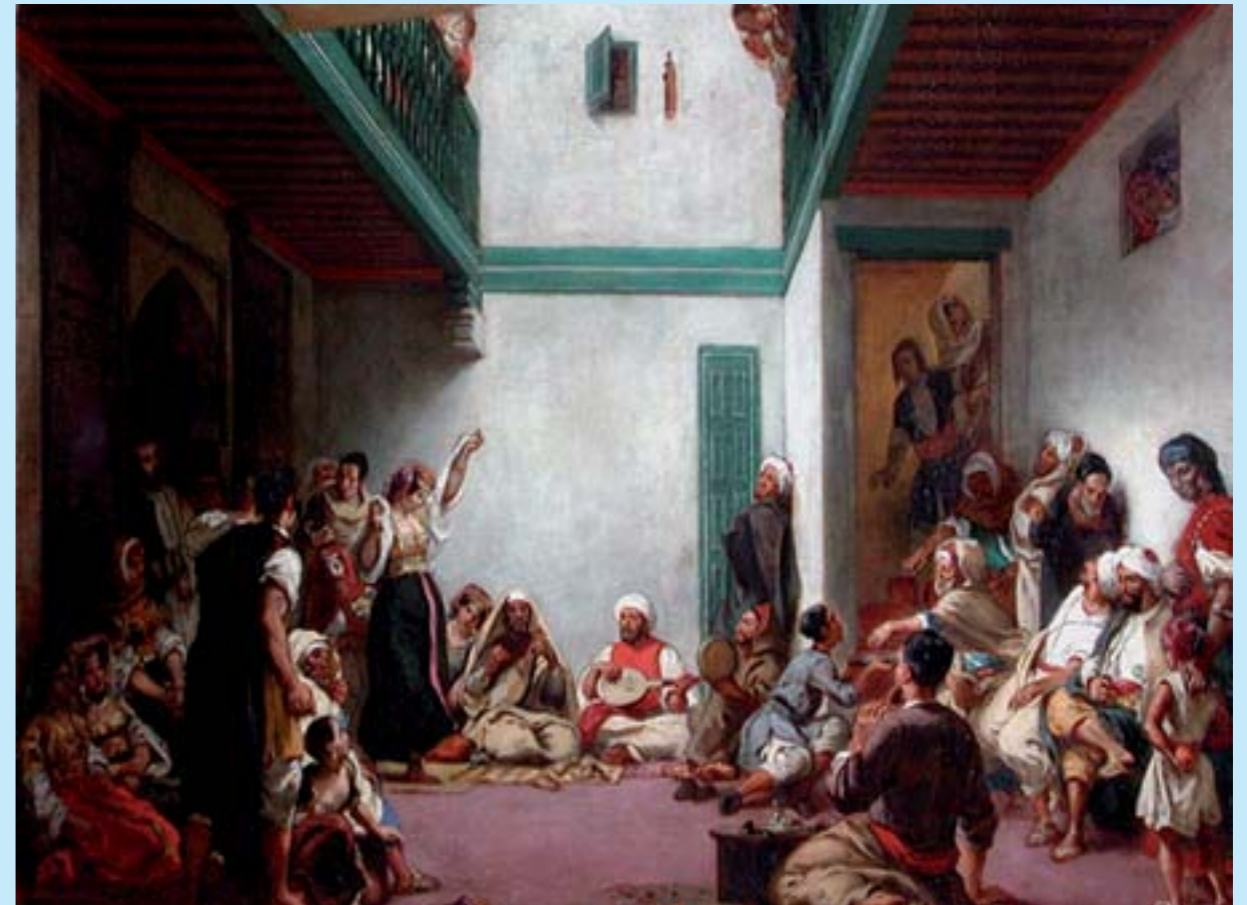
"Jewish Wedding" by Eugène Delacroix