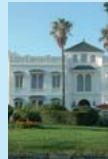
The Palais des Hôtes

The city has worked its magic on so many over the centuries, drawing artists and intellectuals, conquerors and beatniks, millionaires and eccentrics. This is the city that invented globalisation! Tangier is above all an atmosphere, and when you leave it, you have to wonder if it was all just a dream.