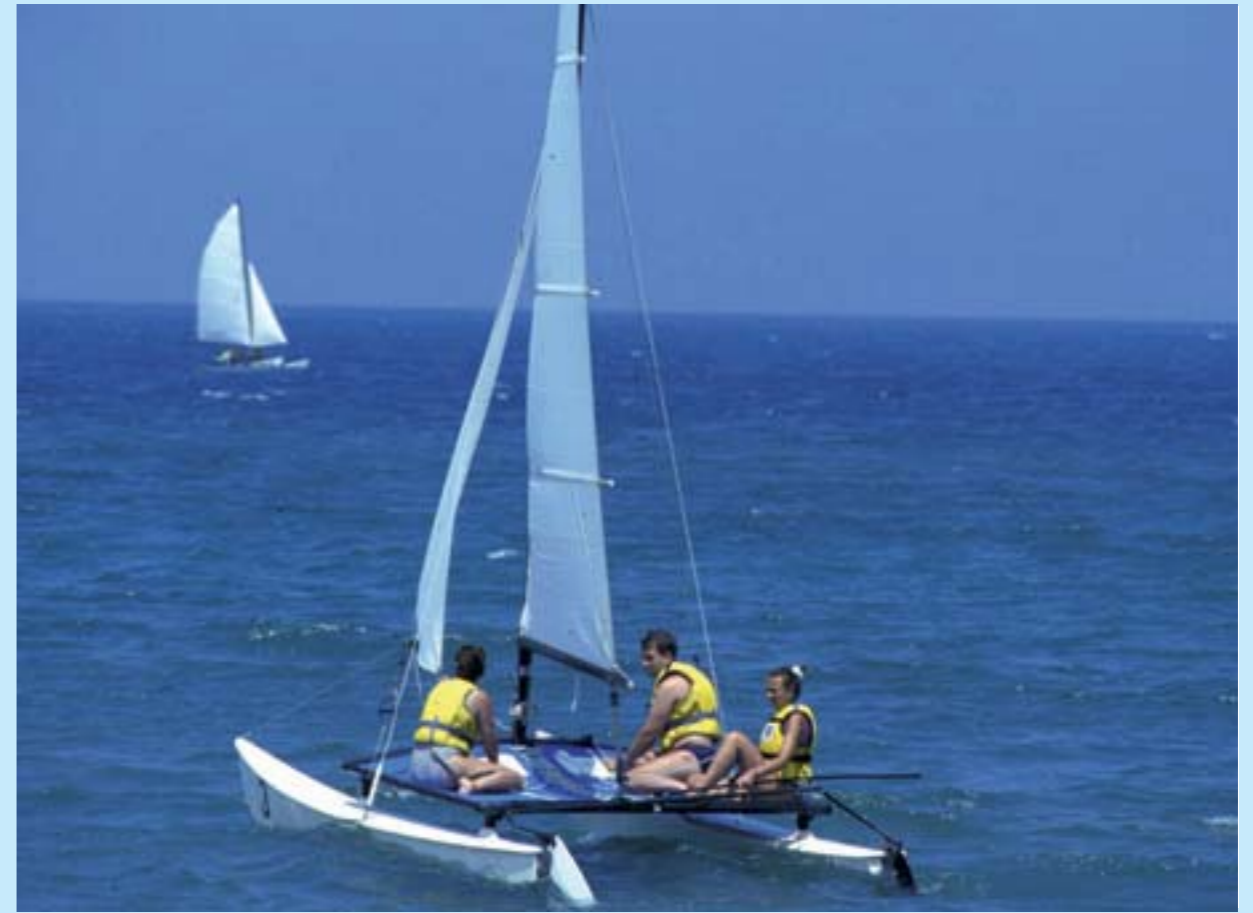
Tangier’s beaches are ideal for a wide range of water sports