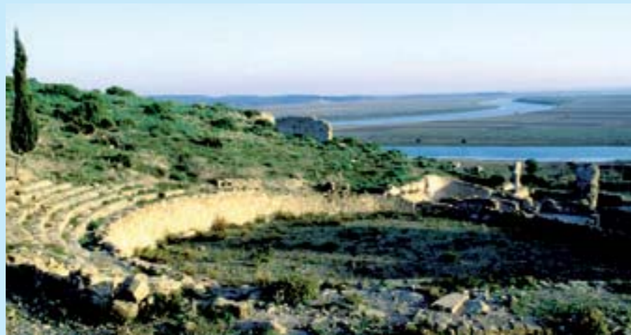
The Lixus archaeological site

Near Larache, the ruins of the Carthaginian and Roman port of Lixus stand on the opposite bank of Oued Loukkos.